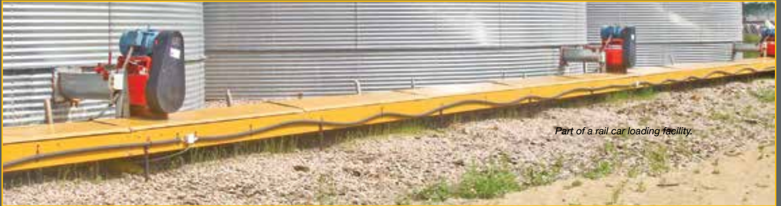
Part of a rail car loading facility.

Conveying product from hoppers or flat bottom storage. Conveying product to the plant. Conveying product within the plant and conveying product for bagging, loading or back to storage. Convey-All can custom design and manufacture to meet your exact requirements.